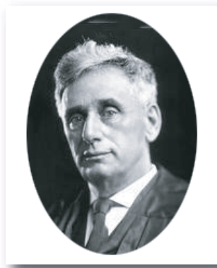
LOUIS D. BRANDEIS (1856-1941)

In addition to a remarkable legal career and the success of his efforts to protect civil rights and economic progressive legislation as a member of the Supreme Court, Brandeis worked tirelessly, if not without conflict, with various Zionist committees throughout the world. He worked with such leaders as Stephen S. Wise and Henrietta Szold, and with them sought ways to create sound structures for health care and economic stability for the increasing numbers of Jews flowing to Palestine. World War I reminded Brandeis and his fellow Zionist leaders of the hazards of war for Jews in Europe and only caused Brandeis to increase his efforts on behalf of the establishment of a Jewish State with a greater sense of urgency.