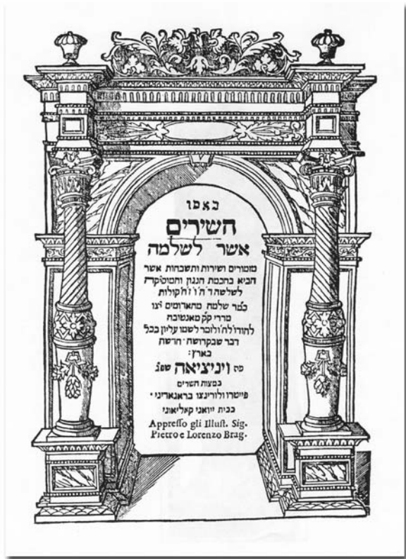
The cover of Salamone Rossi's 1622 publication The Songs According to Solomon (HaShirim Asher LiShlomo) , a play on the opening line of the biblical Song of Songs (Shir HaShirim).

Like that of his contemporary, the famous Christian composer Claudio Monteverdi, Rossi's secular and liturgical music bridged the end of the Renaissance and the beginning of the Baroque eras in Italy. In the Jewish world, by publishing his HaShirim Asher LiShlomo , Rossi performed one of the most progressive acts in the entire history of Jewish music. His synagogue pieces were the first to use Western compositional techniques in the setting of Hebrew liturgical texts. Written for combinations of three to eight unaccompanied voices, the 33 pieces in HaShirim were the