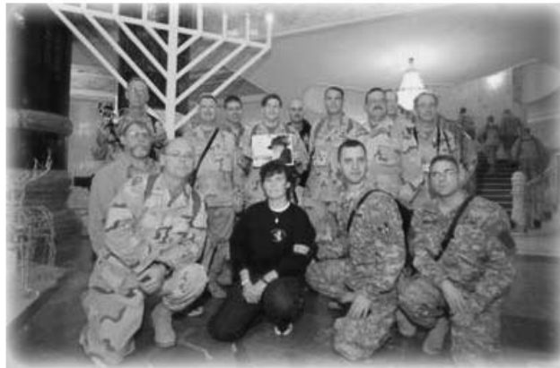
Menorah lighting at Al Faw on the first night of Chanukah

S halom to you! There is only one word to describe this year's Chanukah in Iraq: INCREDIBLE! Services and menorah lightings took place at many bases and FOBs [forward operating bases]. At Al Faw Palace, a huge menorah was lit in the lobby of Saddam Hussein's one-time seat of power. Since Saddam had no shortage of palaces, there