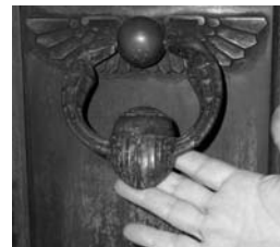
Images from left: crypt door detail, Jewish veterans war monument, Tiffany window, scarab door handle