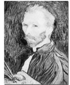
Self-Portrait, 1889 • Oil on canvas

T he Women’s Auxiliary is organizing two private, docent-led tours for Temple members to view the new exhibit “Van Gogh and Expressionism,”